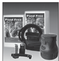
Pond Free® Packages