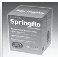
Springflo Filter Media™