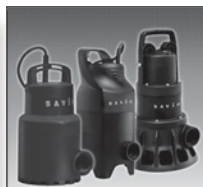
Water Master Pumps™