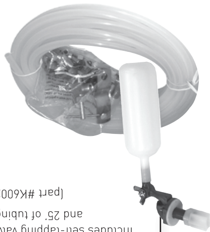
Auto-fill Valve Maintains water level. Includes self-tapping valve and 25' of tubing. (part #K6002)